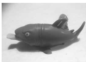
Now just relax and squeeze this stress reliever . . . this week's second prize.

THE STYLE CONVERSATIONAL The Empress's weekly online column discusses each new contest and set of results. Especially if you plan to enter, check it out at wapo.st/styleconv .