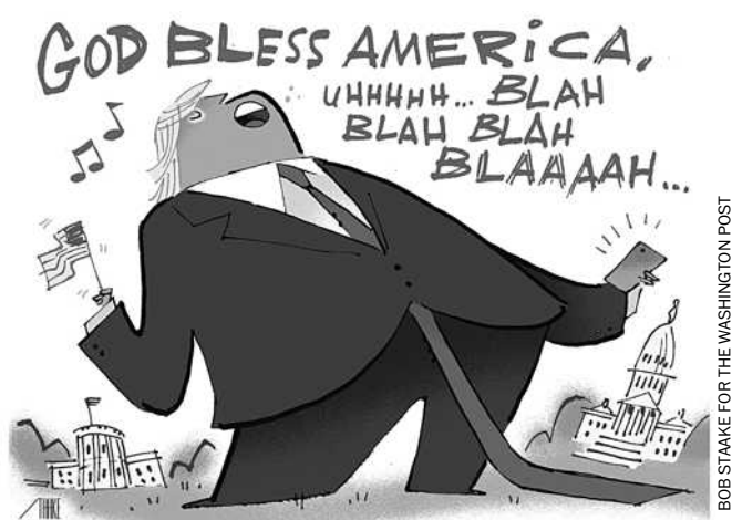
BOB STANKE FOR THE WASHINGTON POST

Catachresis , incorrect use of a word: My catachresic family! Folks correct us, Inferring that our usage is a mess, But their discrete reprisals won't effect us